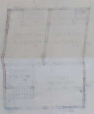
FLOOR PLAN (1/100)